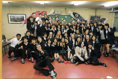
Group Photo at Showa Senior High School