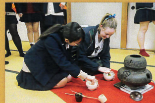
Making Green Tea