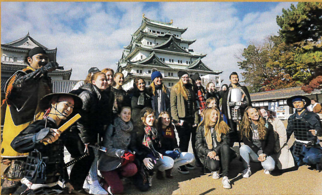
One day trip to Nagoya