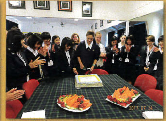
at Earnshaw State College